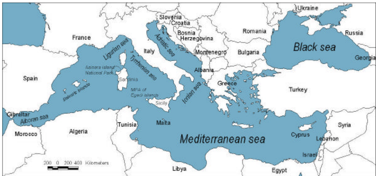
Fig. 1 – Map of the Mediterranean Sea.